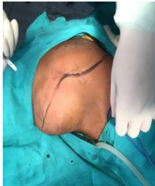
Figure 4 : S shaped incision given.