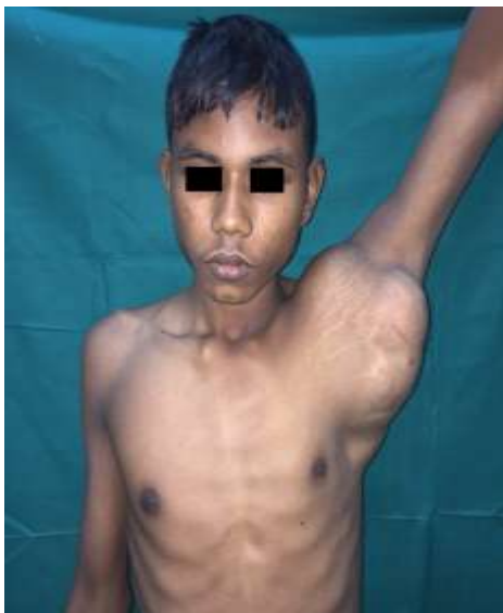
Figure 1 : Pre-operative image showing giant left axillary lipoma.

A 15 yr old boy presented with complaints of swelling on left axillary region since 9 yrs, which was progressive in nature without any other symptoms and loss of functions. There were two scar marks of previous surgeries. Excision of similar swelling was done earlier twice, 9 and 8 yrs back, from axilla and scapular region respectively (Figure 1 & 2).