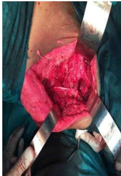
Figure 6 : Intra operative image after excision of giant lipoma.