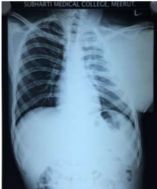
Figure 3 :X-Ray showing compression of rib cage medially.

invaginating in left subscapularis muscle & anteriorly invaginating both Pectoralis major and minor muscle. It also stated compression of lateral wall of chest towards contralateral side (Figure 3). Evidence of involvement of any bone, neurovascular bundle, intrapleural extension was absent.