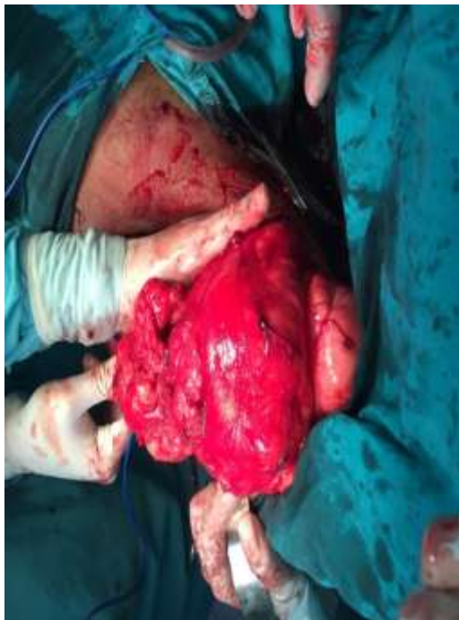
Figure 5 :Intra-operative image showing excision of giant lipoma.