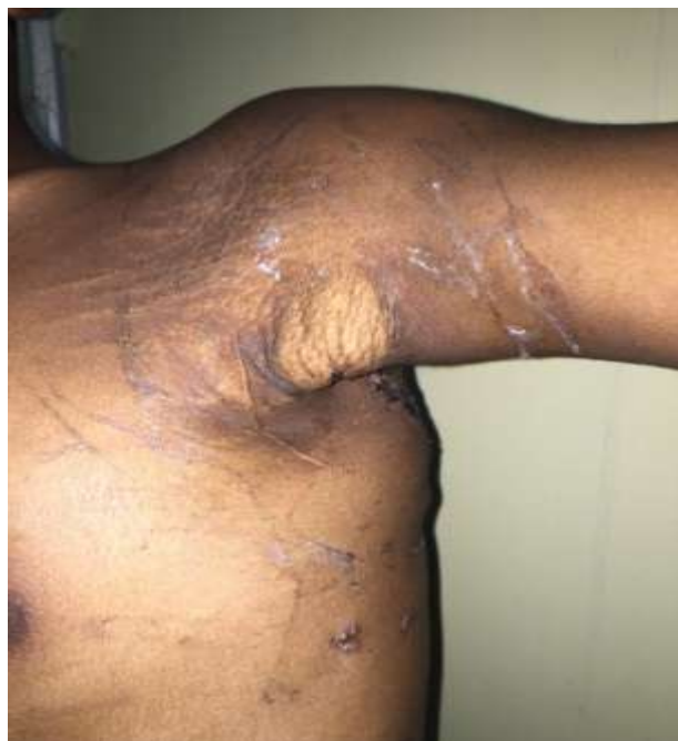
Figure 8 : Post-operative image after excision of lipoma.