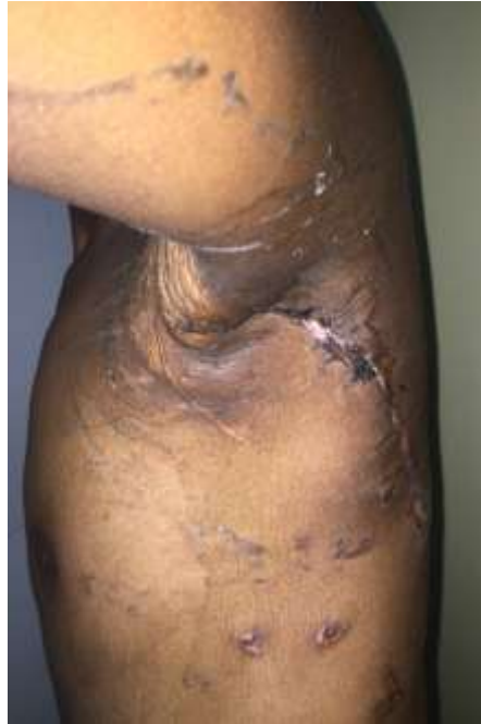
Figure 7 :Post-operative image after excision of lipoma.

Surgery was planned. A S - shaped incision was given over the swelling (Figure 4). Skin flaps were raised and swelling was meticulously resected from all muscle plains (Figure 5 & 6). It was adhered to capsule of shoulder joint which was opened. Swelling was excised and capsule was repaired. Wound was repaired over suction drains. Post-op period was uneventful. Drains were removed on 4 th day. Patient regained all movements normally and was discharged after removing stitches on post-op day 10 (Figure 7 & 8).