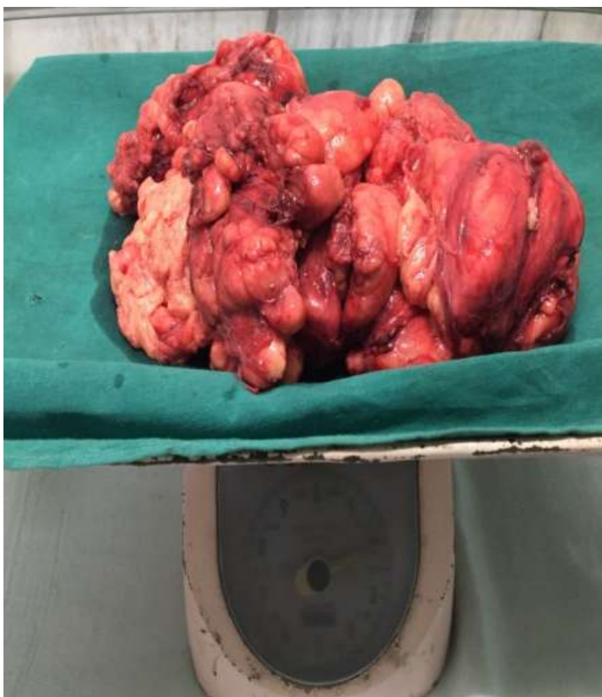
Figure 9 : Excised lipomatous mass weighing around 2000 gms.

The excised lipoma weighed about 2000 gms (Figure 9), with dimensions of about 16x19x14 cms. The records of previous excised swelling is unavailable. Likely, the previous swelling was not been excised completely, some part of which was left behind, as it was growing under the muscle plane, suggestive of recurrence. Along with FNAC, MRI was done to look for extension around axilla, humerus, clavicle, as also, the swelling was too large such that it was compressing the rib cage away from the axilla.